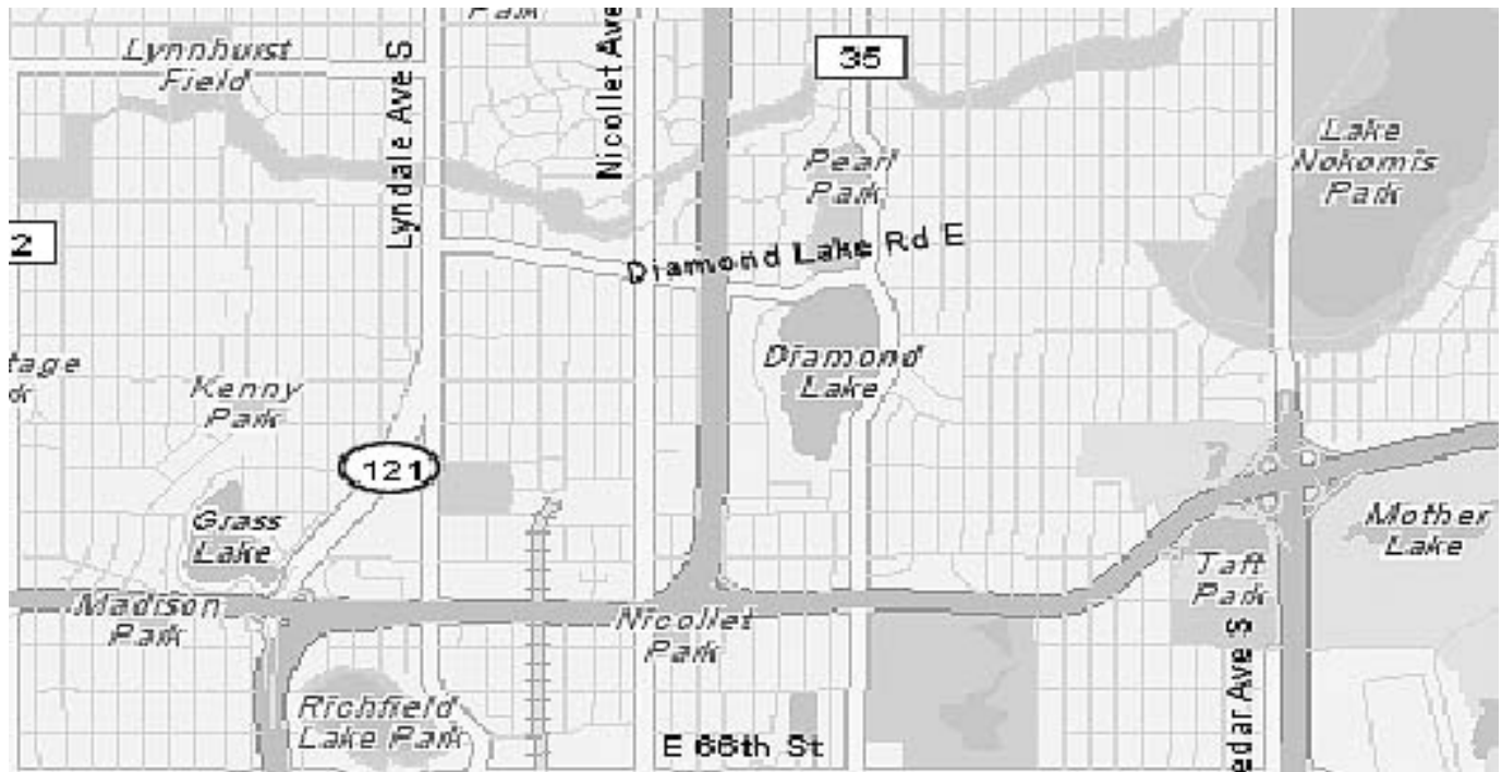
DIAMOND LAKE AND ENVIRONS IN 1873

Obviously much has changed in 133 years, but perhaps most interesting is to see what has become of the lakes pictured in the 1873 map. Pearl Lake was transformed into Pearl Park. The eastern arm of Diamond Lake is now Todd Park. Mud Lake has become Veteran's Memorial Park. Mother Lake is a mere pond to what it once was with Taft Park occupying part of its former bounds. Grass Lake has met a similar fate with Richfield Lake Park taking over its former southern half. Most of this draining of the lakes and transforming them into parks apparently occurred in the years following WWII. By several accounts, those lakes now gone were quite shallow, swampy and no doubt unwelcoming to human habitation, but who can deny a longing to take a stroll through the land as it was in 1873? One final note: Lake Amelia (named for a Fort Snelling officer's daughter in 1819) was renamed Lake Nokomis in 1910 for a character in Longfellow's epic poem: "Song of Hiawatha".